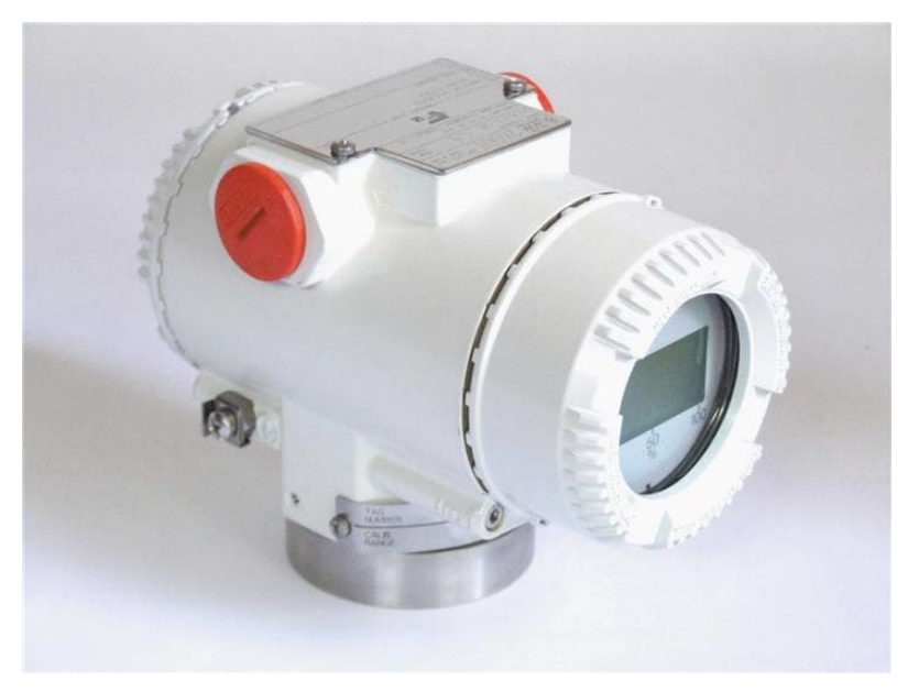
264IB FF Indicator