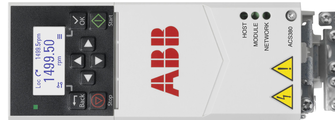
Actual size 2HP ACS380 Drive from the ABB All-Compatible Drive family

With you every step of the way ABB's experts are on hand to offer technical advice from dimensioning through to energy saving. ABB and our partners can help with installation and commissioning, and throughout the operations and maintenance phases of the products' life cycle, providing preventive maintenance programs tailored to your customers' needs.