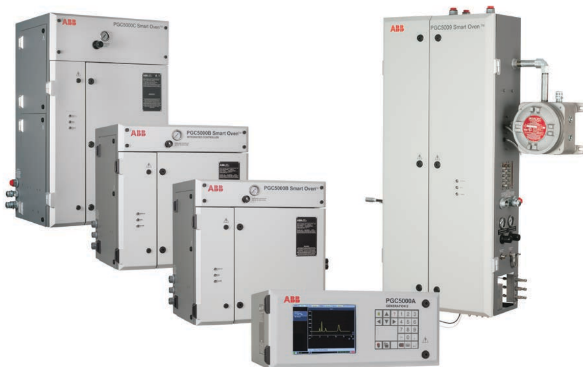
01 PGC5000 controller and oven configurations