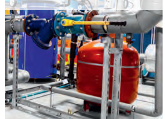
OEMs and machine builders