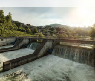
Water and wastewater