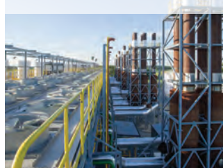
Power generation ancillary processes