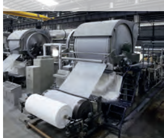
Pulp and paper