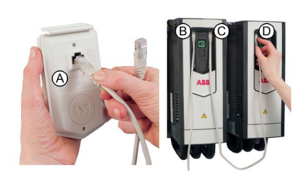
Connection example with ACS880-01 drives. Figure 3

Should one of the drives in the network enter a faulted state, the symbol will change, and the Control panel's LED will start to flash red.