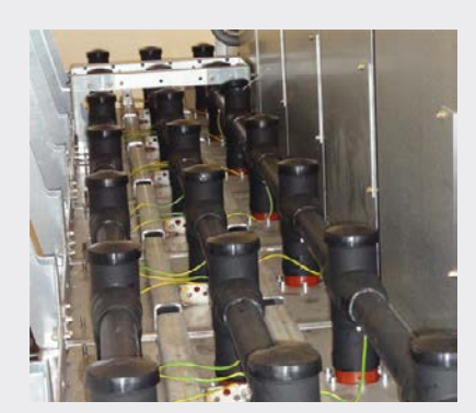
Busbar compartment with support for voltage transformers