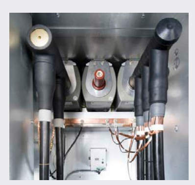
Cable compartment with current transformers

Shockproof voltage transformers are plugged onto the busbars. In the cable termination compartment, the voltage transformers are stationary mounted and isolatable. As an alternative, plug-in voltage transformers can also be used there.