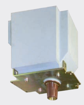
Plug-in voltage transformer