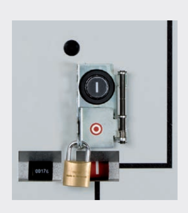
Secured to prevent deearthing