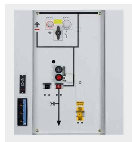
Controls for switching devices

Irrespective of this, the enclosures with their o-ring seals on components, covers and filler valves fundamentally permit the performance of repairs. In general minor damage cannot necessitate the replacement of an entire panel.