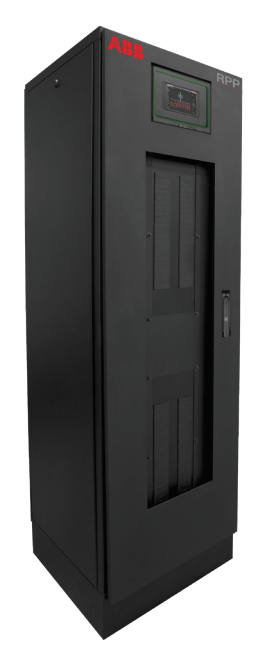
ABB is an innovative leader in critical power switching and distribution, provides its customers with the most advanced RPP lineup in the industry. Cyberex RPPs utilize technology leading circuit protection components and a wide array of advanced circuit management options. Multiple cabinet configurations are available to fit the footprint and access parameters for your data center needs.