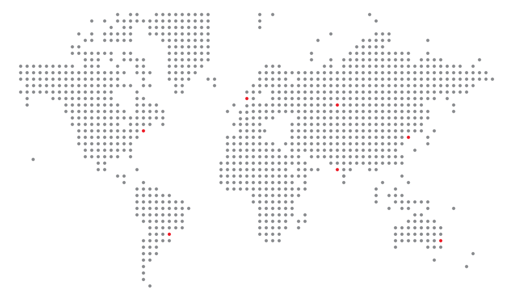
ABB collaborates with grain producers around the world to develop custom products, services and solutions and invests $1.5 billion annually in innovation.

Our local engineering centers facilitate a closer collaboration on projects and are backed by the knowledge of more than 8,000 technologists in seven global R&D centers.