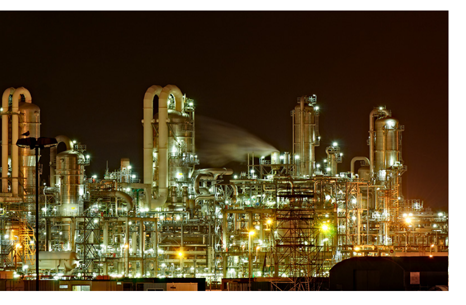
ABB has recently developed a new model of gas chromatograph, the PGC5007B Class Oven, specifically designed for measuring total sulfur. The tool is able to measure samples in liquid or gaseous form and is suitable for applications in refineries and petrochemical plants.