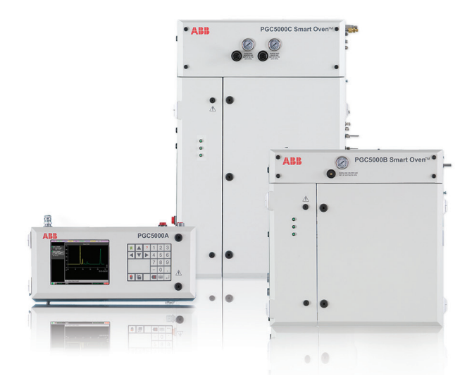
Figure. 1 PGC5000A Master Controller, PGC5000B and PGC5000C Smart Ovens

A fixed volume of sample from the process stream is injected through the sampling valve. Air transports the sample to the furnace inside the isothermal oven, where the sample is completely oxidized by the pyrolytic oven to CO_2 , H_2O and SO_2 . The presence of a reducing gas inside the valve prevents the oxidation of liquid samples inside the valve itself. These components are then separated by using packed columns and pass through the detector (FPD), where the traces of SO_2 are measured at high sensitivity.