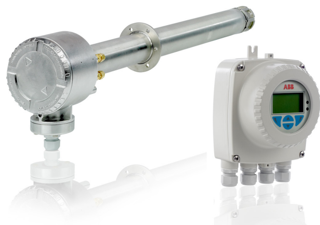
AZ20 Oxygen monitor

With probe lengths up to 4.0 m (13.1 ft) and industry-standard flange configurations, the AZ20 oxygen monitor is suitable for a wide range of applications and extensive installation options