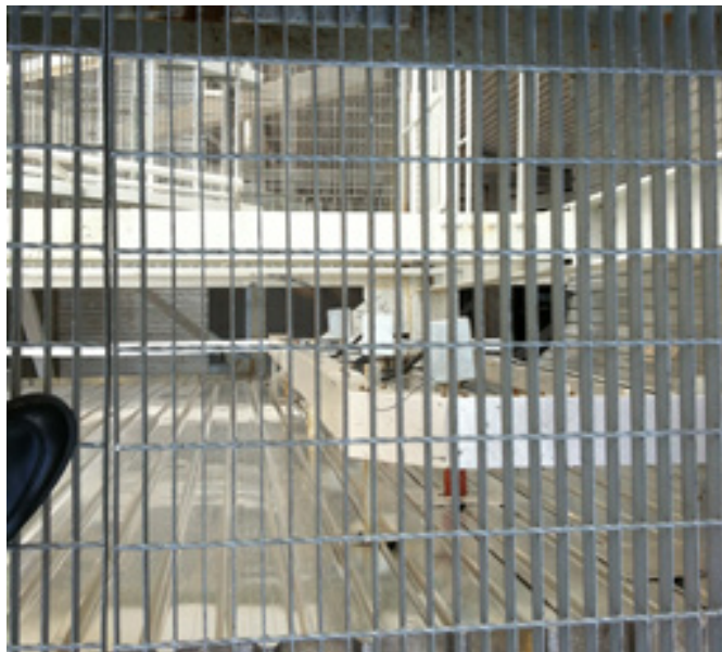
3 probes installed, viewed from an 80 m high platform

"Here at Waigaoqiao No 2 Power Station, today there are totally twelve (12) AZ20 oxygen monitors from ABB Measurement Products installed in the flue ducts. There are six AZ20 oxygen monitors installed on each unit, and Waigaoqiao No 2 power station has 2 units. Three probes are installed on each side of the power station unit. In order to get the most appropriate value we take the average value from the 3 probes installed on each side."