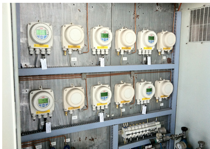
AZ20 zirconia transmitters in situ