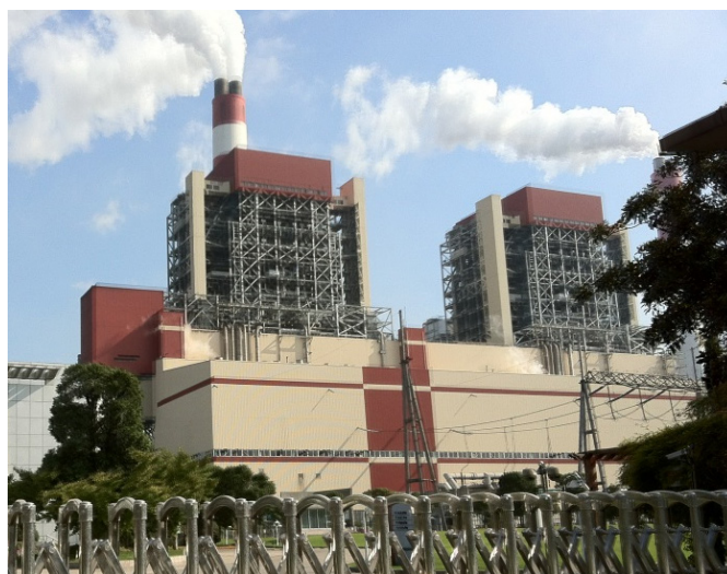
Waigaoqiao Power Station, Shanghai, China