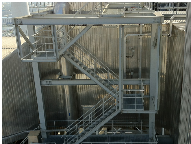
3 probes installed on every side of the ducts

"The AZ20 oxygen monitors have been running for 6-12 months and they are working very well. We have not had any problems whatsoever."