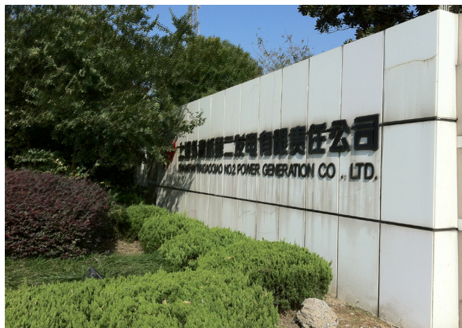
Gate entrance to Waigaoqiao No 2 Power Station

“The unique integrated auto-calibration system provides easy compliance for emission monitoring regulation and reduced installation costs.”