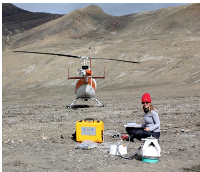
More photos showing the UGGA in operation above the Arctic Circle (on Axel Heiberg Island (Axel Heiberg Island is an island in the Qikiqtaaluk Region, Nunavut, Canada. Located in the Arctic Ocean, it is the 31 st largest island in the world and Canada's seventh largest island. According to Statistics Canada, it has an area of 43,178 \text{km}^2 ).