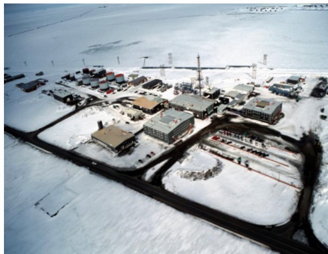
Prudhoe Bay oil field

The Prudhoe Bay field is the largest field in North America and the 18 th largest field ever discovered worldwide. Of the 25 billion barrels of original oil in place, more than 13 billion barrels can be recovered with current technology.