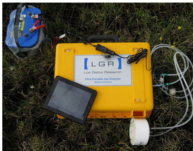
The sample valve for gas samples is inserted directly into the body of the furnace