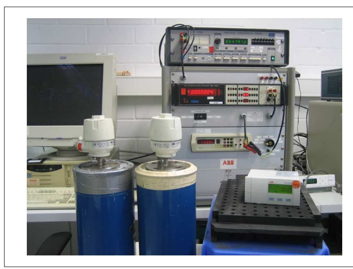
Fig. 2-1: Calibration setup of the measuring system

Environmentally ruggedized "heavy duty temperature sensors" are predominantly used for this purpose as they are perfectly suited for especially harsh operating conditions. They also excel by an extremely short response time (2.5 s to 3.5 s) and their possible usage in hazardous areas. Additionally, they comply with NAMUR recommendations NE21/23 and 24.