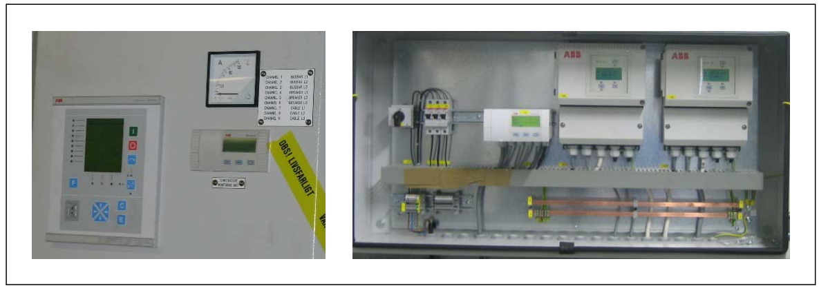
Fig. 3-1: FCU400-P flow computer unit as a field-mounting device placed on Z rails in a switch cabinet (right-hand side) or as a panel-mounting device integrated in the switch cabinet front door (left-hand side)

At the customer site either a field-mounting SensyCal FCU400-P flow computer unit is mounted on Z rails in a switch cabinet or a panel-mounting model is integrated in the cabinet door.