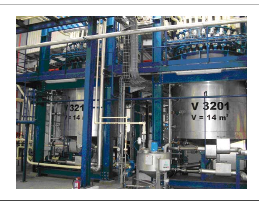
Fig. 5-3: Charge mixture