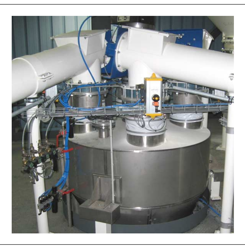
Fig. 5-1: Powder production