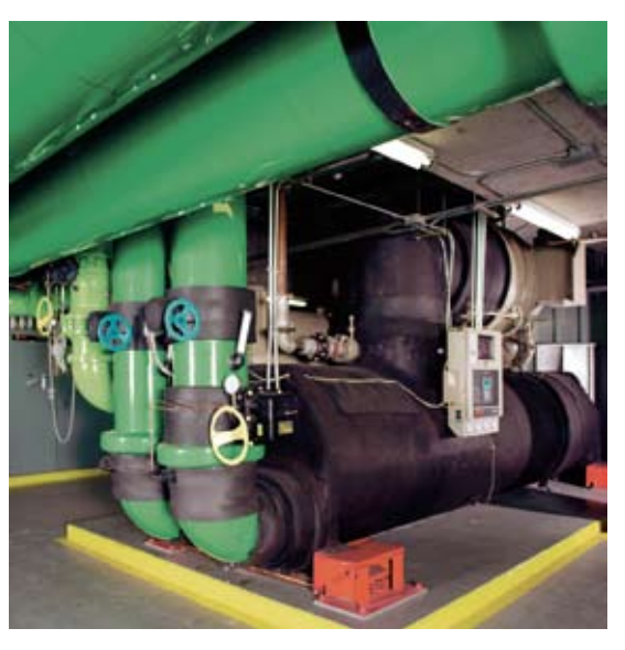
A chiller unit (One America Plaza, San Diego, CA, USA).

through the chiller evaporator (3.). The water temperature is reduced by 5 to 10°C in the evaporator and it is then supplied back to the rooms. The variable water circulation is achieved by the AC drive (2.), and the control parameter is the differential water pressure in the most distant room in order to keep the pressure high enough for the thermostat valves. The differential pressure is measured by the transmitter (4.).