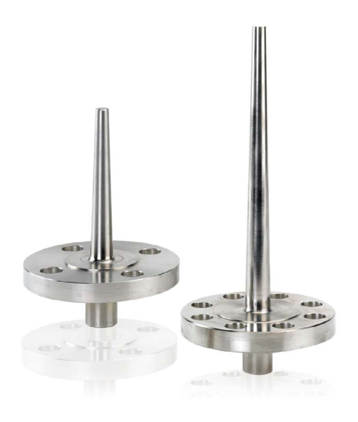
Fig. 2 Two solid drilled thermowells both with forged flanges

Thermowells for more demanding applications can be manufactured from solid material. A solid bar of material is drilled to within a defined distance from the end of the bar and a suitable plant fitting is either machined into the bar material or attached to it by means of welding in the case of metal thermowells.