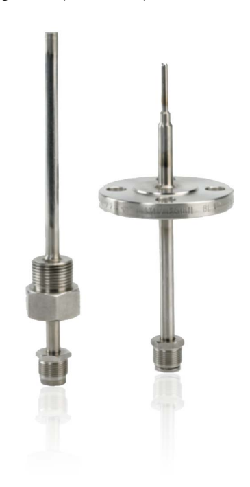
Fig. 1 Two pipe-type thermowells

The simplest thermowell is made from tube material that is sealed at one end and has some form of fitting to enable it to be attached to the plant. These pipe-type thermowells are often made from high-integrity, seamless, stainless steel tubing. Fig. 1 shows two pipe-type thermowells – note that the flanged thermowell has a reduced tip for greater speed of response.