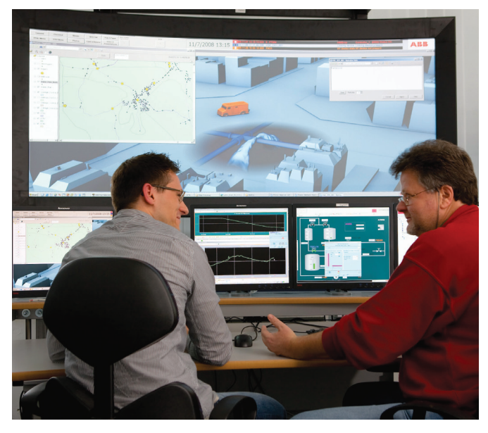
Accurate measurement of flow is critical to the smooth running of water distribu-

Whichever meter type is used, regular verification of accuracy will be needed to help minimise the impact of any errors.