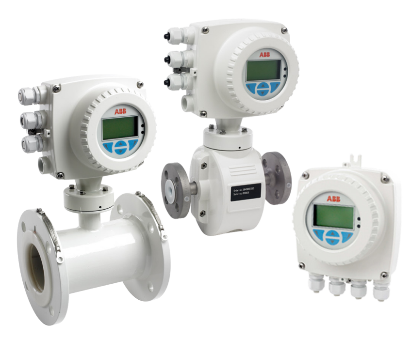
ABB's WaterMaster electromagnetic flowmeter offers accurate and reliable measurement for water supply network management applications.

All ABB flow meters are designed and manufactured in accordance with international quality procedures (ISO 9001) and are calibrated on nationally-traceable calibration rigs to provide the end-user with complete assurance of both quality and performance.