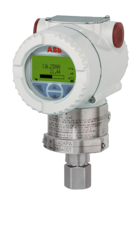
2600T pressure transmitters