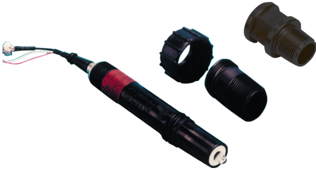
Figure 2 The TBX551 can be mounted in 1 inch tees in sample line installations

ABB's Twist Lock TBX551 sensors (see Figure 2) are ideal for sample line installations in sugar refining applications. The bayonet-style mounting facilitates sensor removal for cleaning and calibration. If the pH sensor is to be inserted directly into the process, ABB recommends a retractable sensor with an extraction housing. The extraction housing has flushing ports that can be used to loosen congealed sugar and particulates.