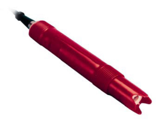
Figure 1 ABB TB556 pH Sensor

The pH sensor in any mineral processing slurry should be mounted so that there is sufficient velocity past the sensor to minimize lime scale and material buildup. However, a compromise should be attempted so that abrasion to the sensor glass and body are reduced. A good mounting location is at an overflow weir or a transfer point in the leach or CIP tanks.