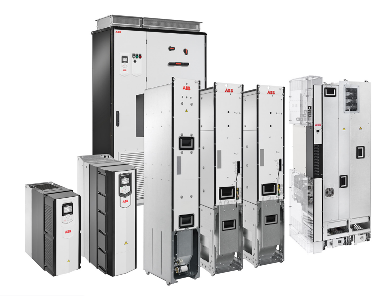
ABB industrial drives ACS880 regenerative drives, 3 to 3300 HP

ACS880 regenerative drives are suitable for applications with cyclic or continuous braking. Regenerative drives are capable of recovering braking energy and feeding it back to the network. The drive package includes everything needed for regenerative operation.