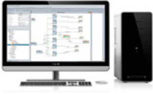
ABB Cylon® ASPECT® supervisor and engineering