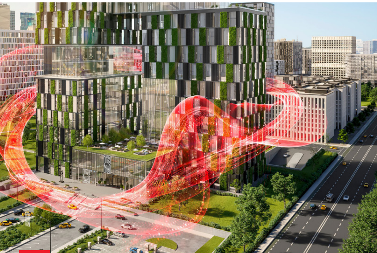
ABB Cylon ® Building Solutions