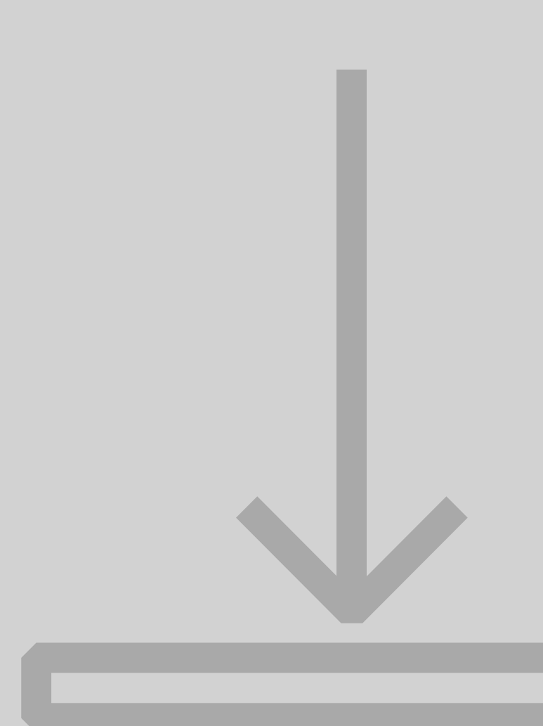
ABB i-bus® Tool

Professional with Energy Function (Link)