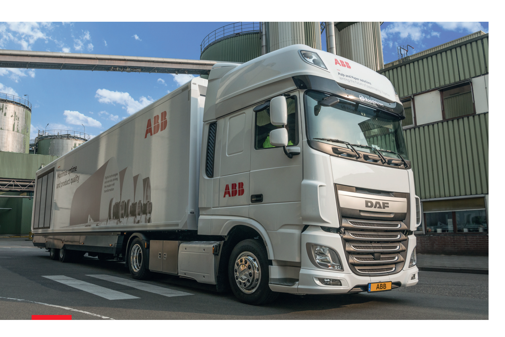
ABB European Pulp and Paper Tour