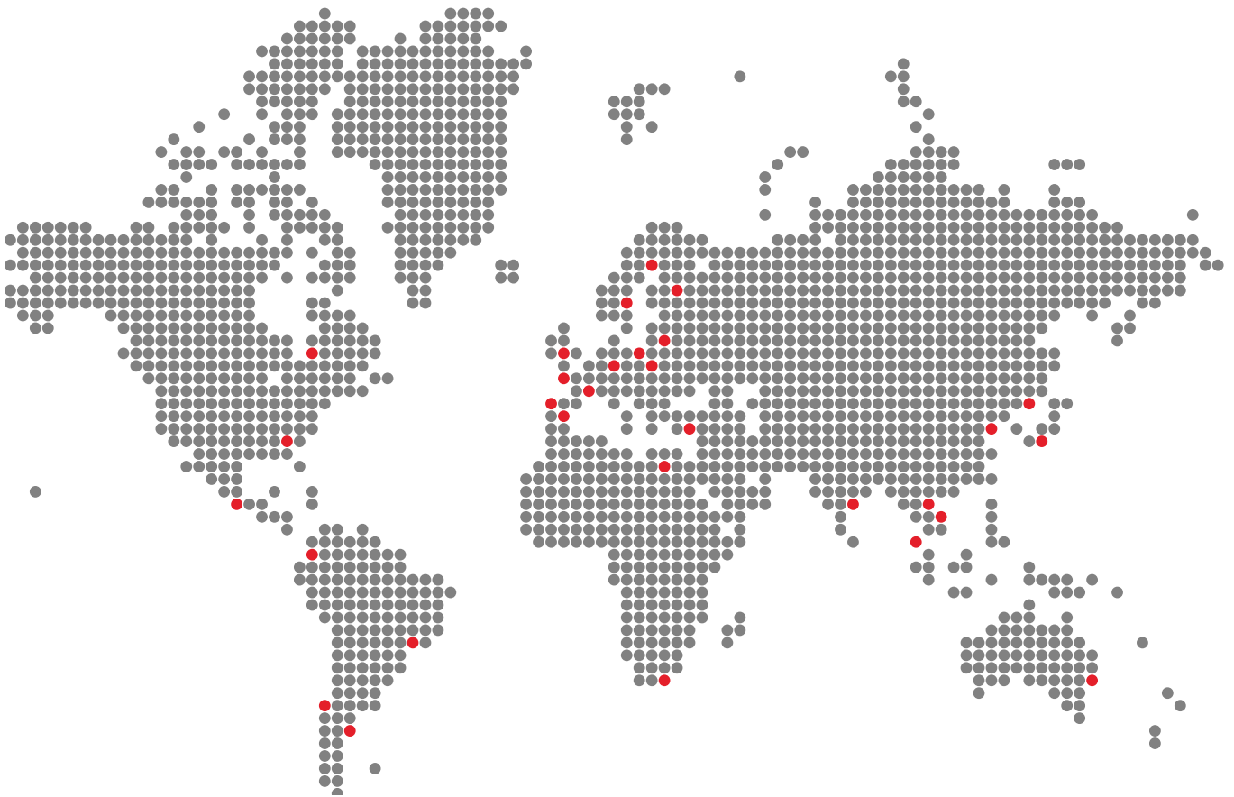
ABB provides customers with service solutions to operate, maintain and optimize their mills. ABB is present in more than 40 major pulp and paper countries. While we maintain a global perspective on the industry, we deliver services with a local touch. That includes support for all instruments and automated paper testing. Plus, our ISO 9001 certification enables the highest quality for all our service and support, available anywhere in the world.