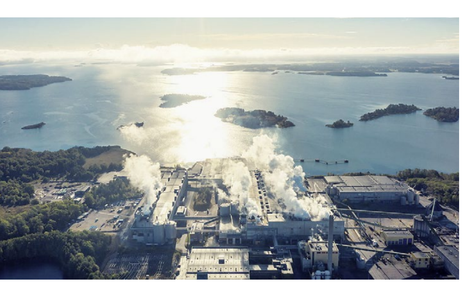
ABB boosts Swedish printing paper producer's availability with modernization package for winder

Holmen's paper mill in Braviken just outside Norrköping, Sweden produces printing paper in one of the world's most productionefficient mills. With high demands on equipment that lead to availability challenges, the mill turned to ABB for an upgrade and optimization project that helped the mill reduce downtime and improve runnability.