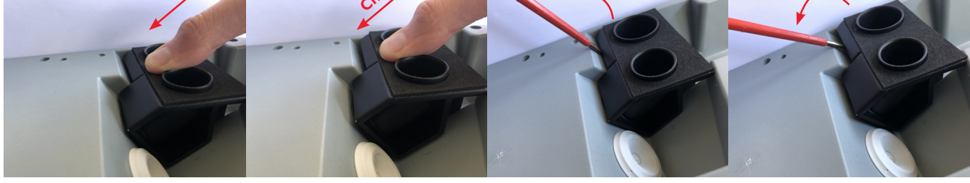
Push to secure adapter