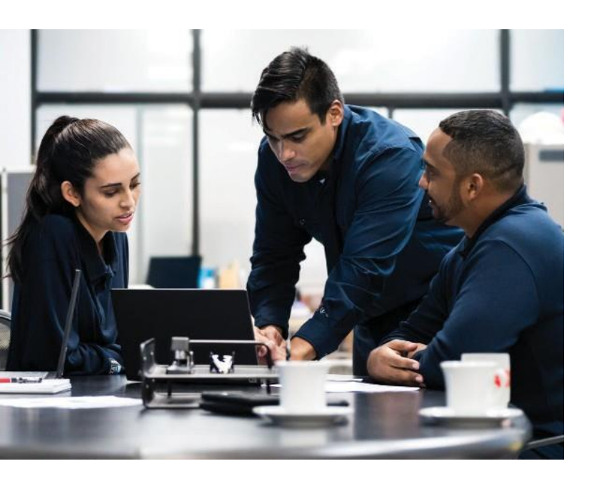
ABB Drives (U.S.) offers a new learning experience designed for the current digital era. It includes live remote training, hosted remotely by qualified ABB trainers, for channel partner authorization and end user programs.

We ship our equipment, along with printed training materials, to your facility. Students complete hands-on exercises for each program to fulfill the authorization requirements.