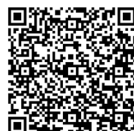
ABB Installation Products F&B Extreme temperatures

ABB Installation Products F&B Anti-microbial