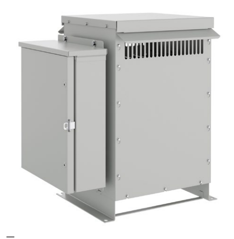
ReliaGear® XFMR - Servicenter™ 15 kVA