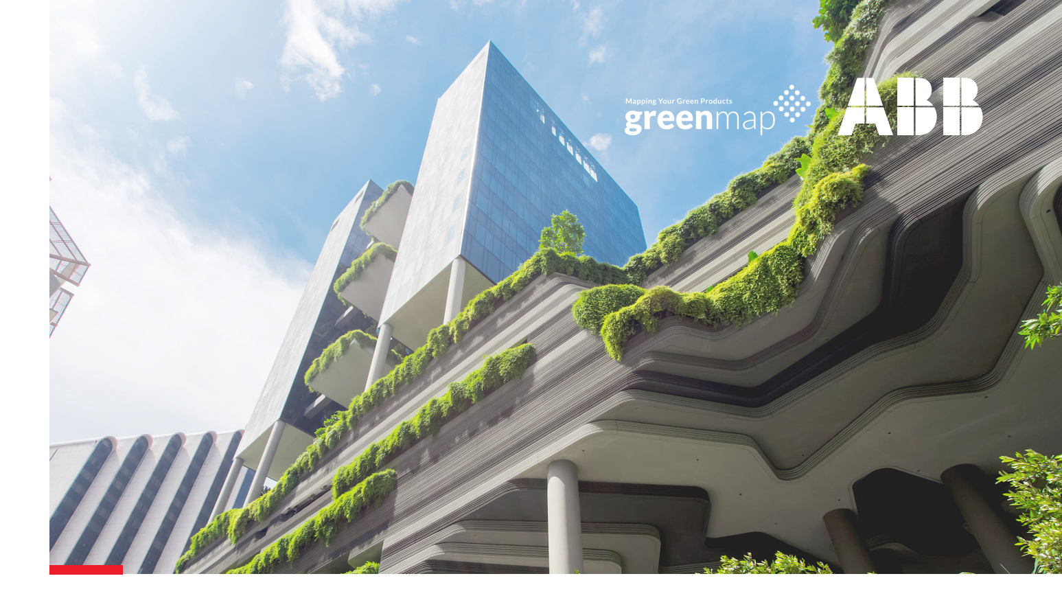
ABB Ability<sup>™</sup> Energy and Asset Manager and LEED® V4 certification