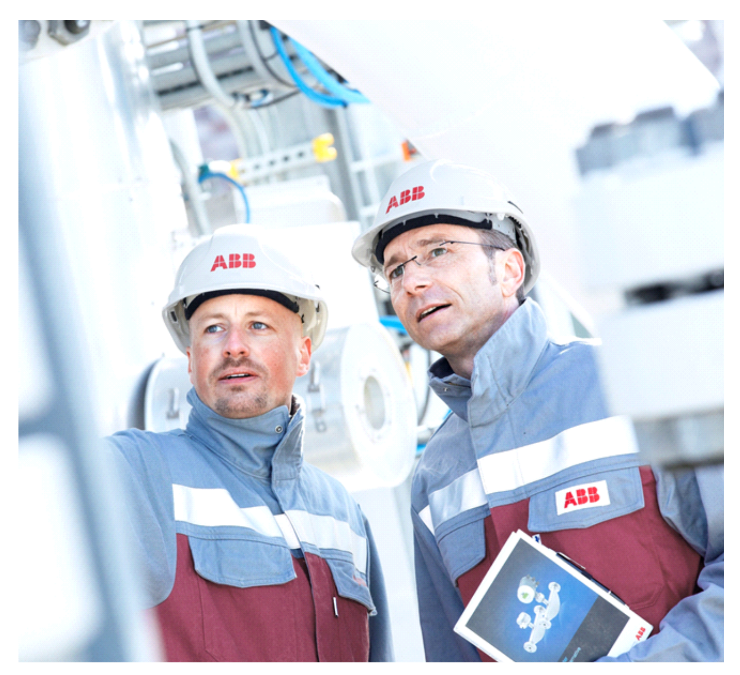
Consulting Services Smarter thinking. Safe, sustainable operations.