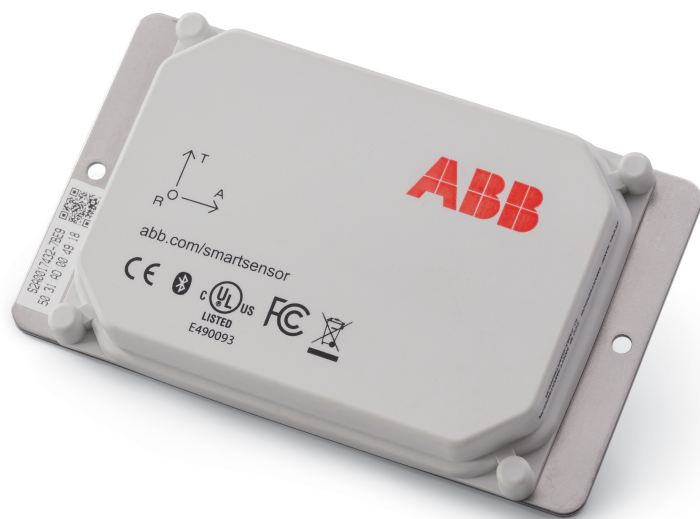
ABB Ability™ Smart Sensor for general machinery Installation with mounting putty

IMPORTANT! Read these instructions in their entirety before installing installing the ABB Ability™ Smart Sensor for general machinery.