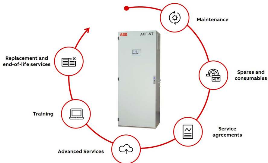
ABB offers a complete suite of service products for ACF-NT gas analyzer systems which are designed to maintain the intended accuracy and availability of your asset over the product lifecycle.

Condition monitoring, maintenance and training