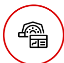
ABB genuine spares - Essential to keep your analyzer in peak operating condition

response either on site or remotely, when connected to our condition monitoring tools.