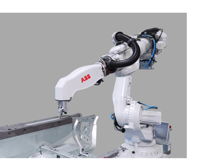
ABB offers a complete robotic solution based on ultrasound, for quality inspection of spot welds. The Ultrasonic Spot Welding Quality Inspection is a functional module ready-to-use: an integrated solution optimized for a fast and accurate inspection.

— 01 Ultrasonic Spot Welding Quality Inspection functional module