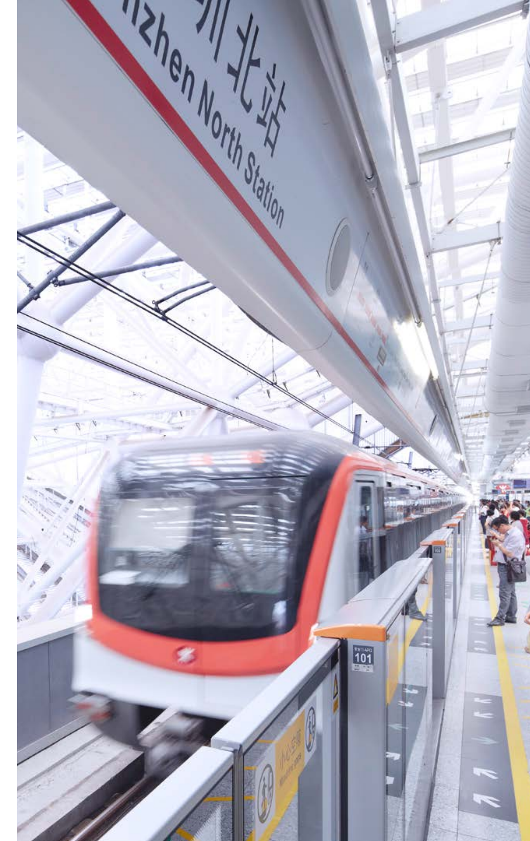
ABB is a reliable global partner that can provide with high technology products and solutions which meet even the most stringent requirements. ABB solutions cover everything from trolleybus, light rail, metro and suburban railway systems to main line railways – all of which need to be safe, reliable and efficient.

Traction power supply systems require highest availability in a harsh environment with very demanding application conditions.