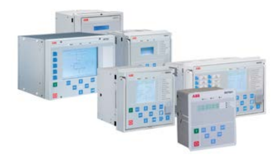
ABB delivers a full range of genuine IEC 61850 protection and control products also including network automation. ABB's IEC 61850 compliant solutions offer a unified user-experience for operating power distribution systems. The unified user-experience provides enhanced reliability, safety and the operational efficiency of network control and management. The protection and control devices also measure and collect data from the traction power system and intelligent network components to support the asset and business management.