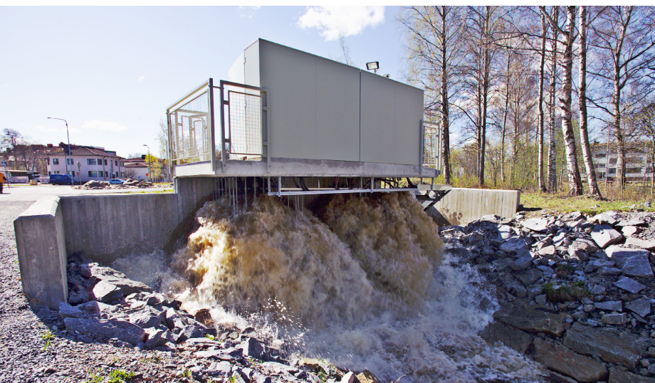
ABB Electrification Services team has the experienced resources, capabilities, and products to provide a total response when disaster strikes.