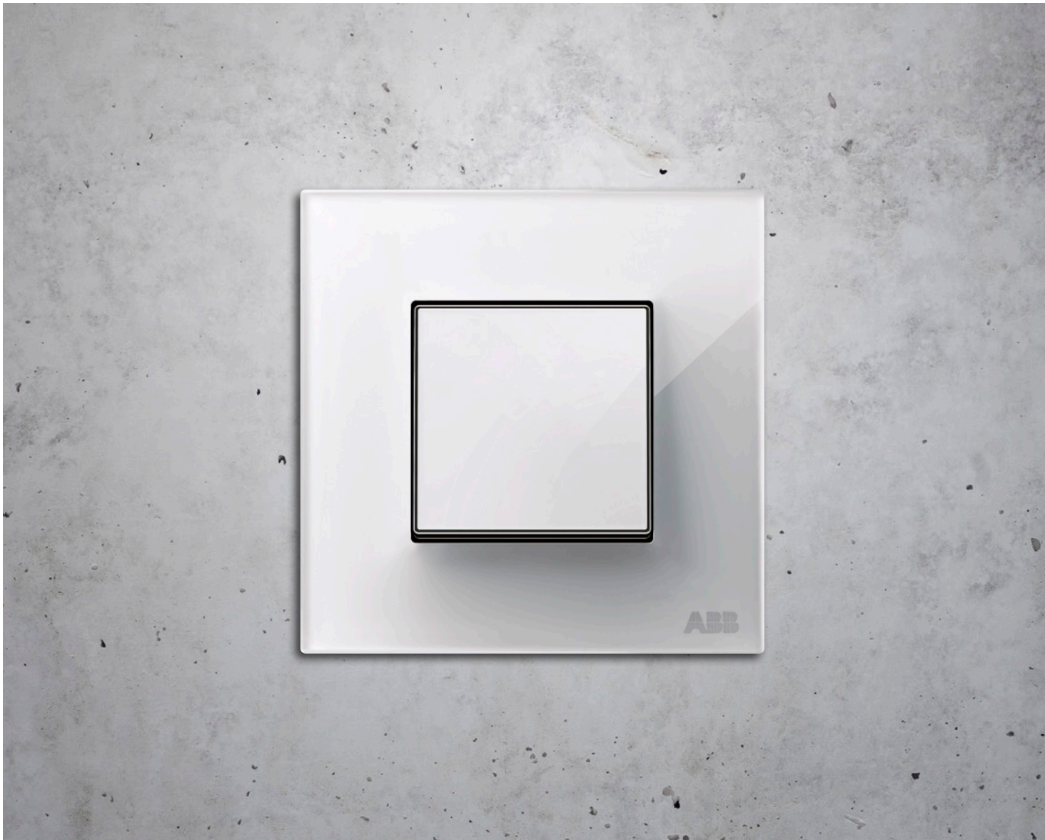
Illustration in original size The cover frame measures 86 mm x 86 mm x 4 mm (w x h x d). Material: black and white frames are made of pure glass material

Modern and contemporary finish, White Glass and Black Glass made in pure glass material, to complement the four elegant finishes of Millenium made in metal: Stainless Steel, Silk Black, Antique Gold, and Matt Gold. Designed by the famous European designer Josep LLusca.