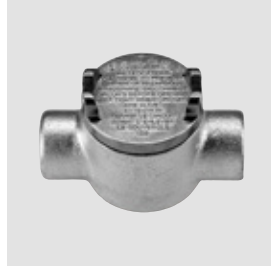
ABB offers a broad range of explosion-proof fittings for rigid conduit systems to safely distribute electrical wiring in hazardous locations.