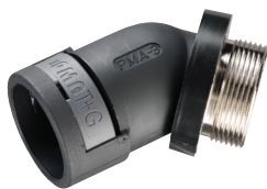
Connector 45° elbow with metal threadIP68metric