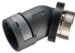
Connector 45° elbow with metal thread IP68 metric