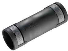
Connection Splice for flexible Conduits IP68