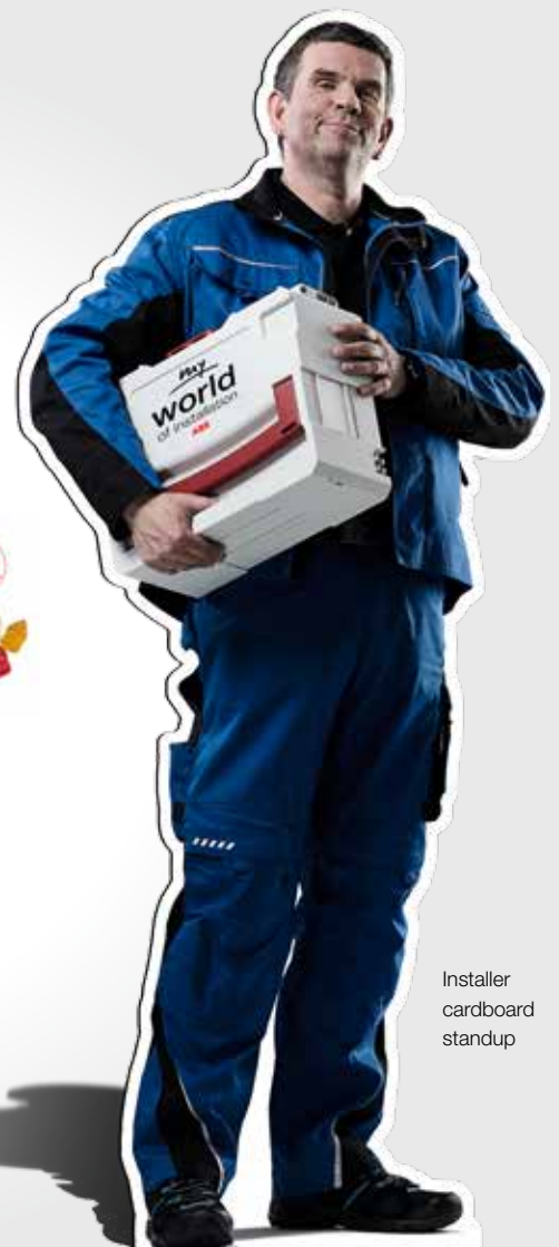
Installer cardboard standup