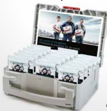
Candy box for haribo sweets on your counter