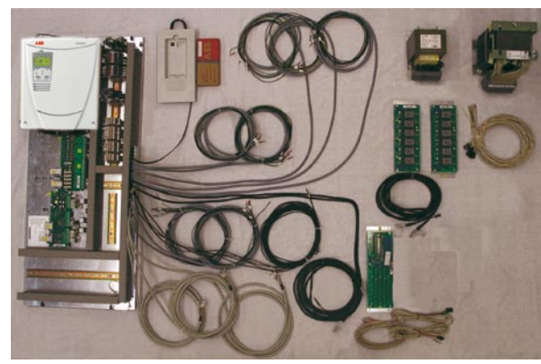
Typical scope of delivery

All essential components are in the standard scope of delivery. Besides, every TYRAK8 Rebuild Kit may be ordered with a various range of options: