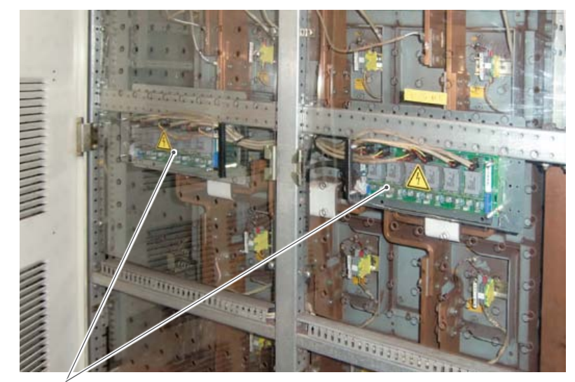
Location of SDCS-PIN-48