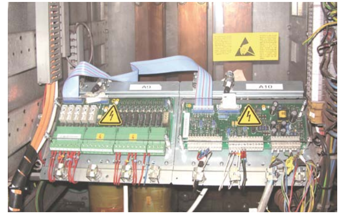
Location of I/O interface

Further documentation see TYRAK L upgrade and installation manual (3ADW000416R0101).