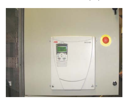
TYRAK L Control Door, front

Basic Rebuildkit control board mounted on new door DCS800 Rebuild Set TYRAK L (2Q) 3ADT220164R0001 DCS800 Rebuild Set TYRAK L (4Q) 3ADT220164R0002