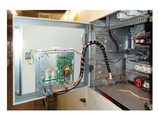
TYRAK L Control Door, rear side