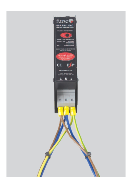
Figure 3: For connecting leads up to 50 cm, use two sets of conductors (L, N, E). Each set of conductors has been tightly bound and separated in their routeing.

Hence, the recommendations are only included for reference.