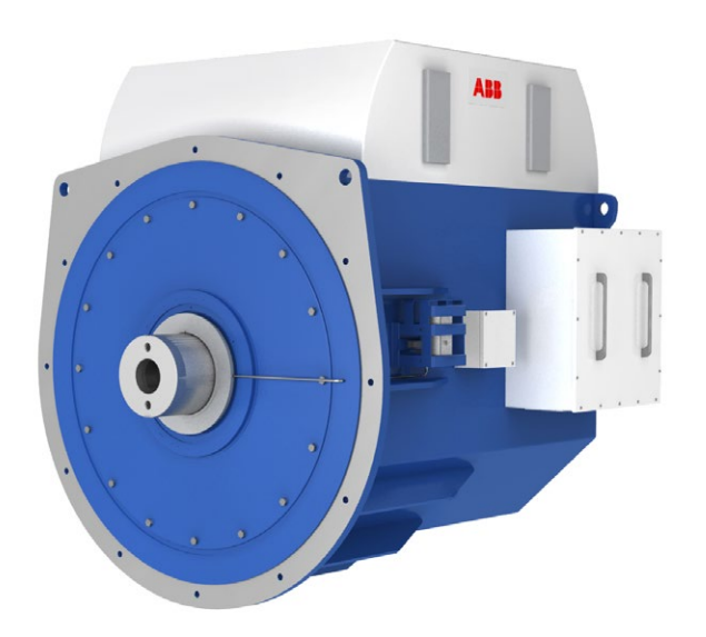
ABB Medium speed permanent magnet wind power generator

The highest efficiency and reliable slower speed design