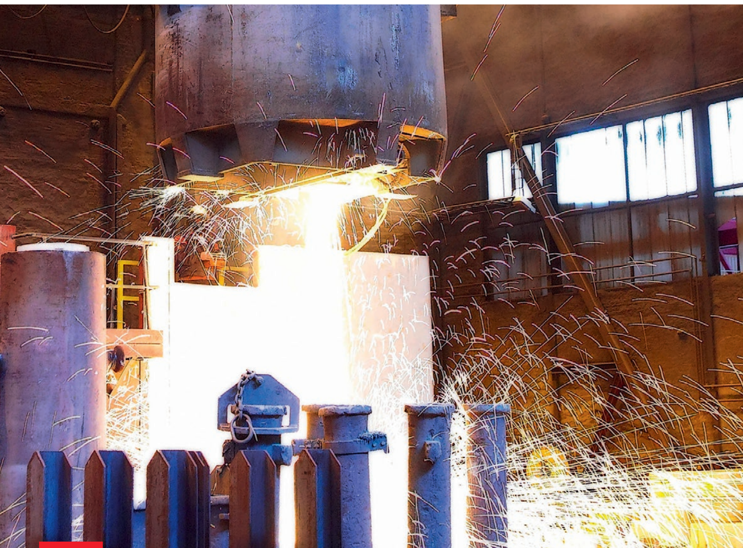
ABB in metals

Helping our customers boost productivity while conserving energy