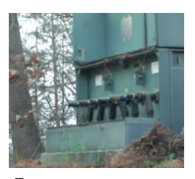
ABB Installation Products' solution was based on Elastimold<sup>™</sup> switchgear that uses solid dielectric and vacuum technology. Elastimold was one of the first manufacturers of a fully solid dielectric switchgear in the industry with manufacturing experience that dates back to the 1960s. Elastimold has two main components that are the core of its switchgear product offering — the molded vacuum switch (MVS) and molded vacuum interrupter (MVI).