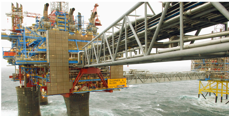
Sleipner platform