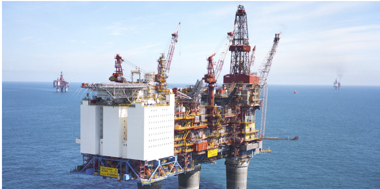
Gullfaks A platform