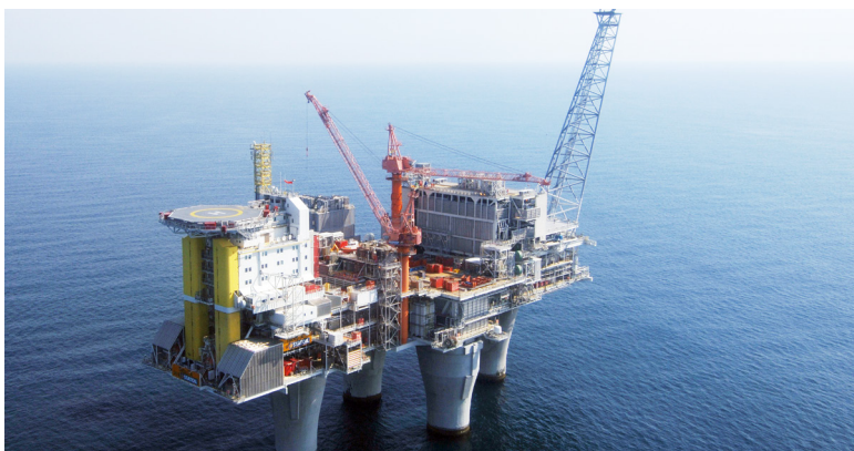
Troll A platform