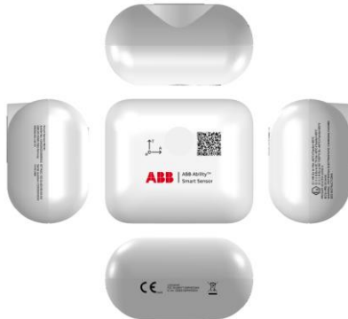
Figure 1: ABB Ability™ Smart Sensor enclosure