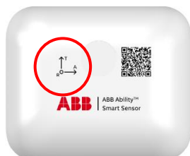
Figure 2: Location of NFC antenna in sensor, below axis cross

Deactivation of sensor: Deactivation of sensor is done from smart phone app.