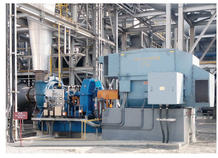
Pump motor soft started by the ACS5000 to reduce mechanical wear and tear.