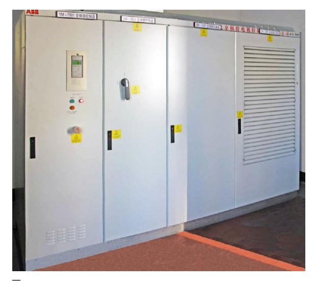
ACS1000 variable speed drive controlling the mixer at the Daqing Petrochemical Plastic Factory in China.